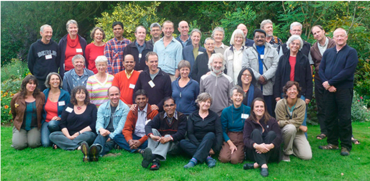
The first international council

The Triratna Order and community has six areas around the world: the South Pacific, North America, Mexico and Latin America, India, Europe, and the UK.